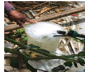
No clogging-Reduces minerals to a foam

STRIP-IT PRO will eliminate the environment for over-wintering pest such as fungus gnats, insects, algae, and diseases. Following with KleenGrow will provide up to 30 days residual algae and disease control.