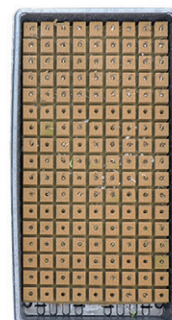
2ppm PACE KLEENGROW