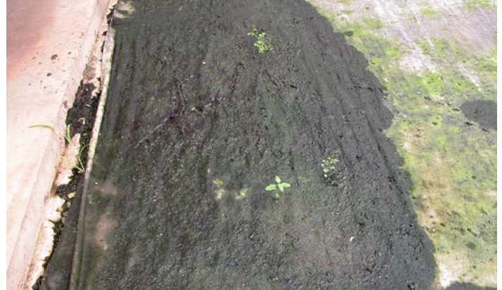
Algae and biofilm under benches can harbor pathogens that can cause disease.

Contact GGSPRO for bulletins that detail sanitation protocols. Read and follow all product labels. Products other than those mentioned may also be safe and effective. Registration status may vary by state.